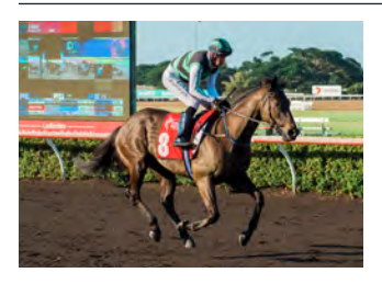
DAY 1 $75,000 HOT100 DARWIN GUINEAS (1600M)